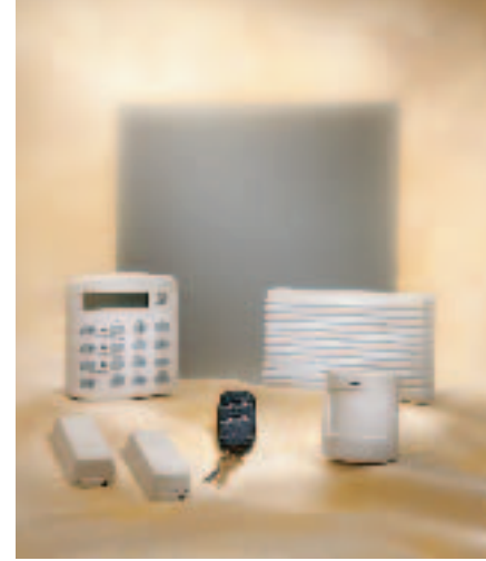
GE Concord security system

Emergency Alarms send a panic signal to the proper authorities. Sirens sound and help is summoned.